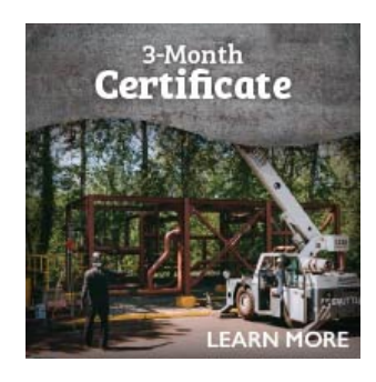
Introducing a fast way to boost your savings! Snag our limited-time <u>3-month</u> <u>certificate</u> with a 3.97% APY* with a low $500 minimum deposit. Perfect for both new and existing WFCU funds.